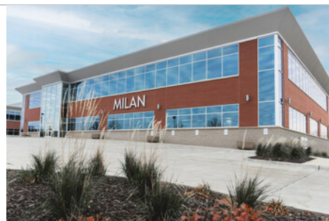
Milan Laser Corporate Office Omaha, NE

For complete results of the Inc. 5000, including company profiles and an interactive database that can be sorted by industry, location, and other criteria, go to www.inc.com/inc5000 . The top 500